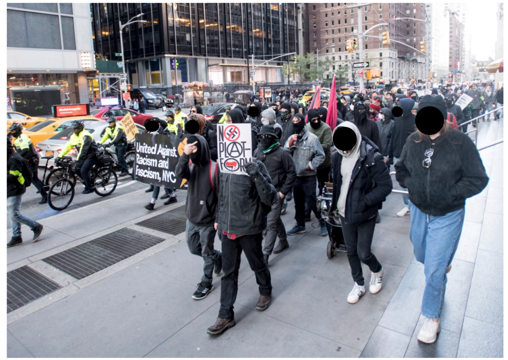
Above: antifascists enroute to confront Proud Boys at Trump Tower, Manhattan

For the third year running, New York City saw more hate-motivated violence than any other city in the world, with 31 attacks that we documented in 2020. This was more than six times the average number of hate-motivated violent incidents in any city or region with 3 or more such incidents occurring in 2020. As mentioned above, the violence shifted in that city, with the majority of the violence moving from Brooklyn to Manhattan in 2020 and targeting primarily Asians, whereas the majority of violence in New York in the previous three years was directed at the Jewish community.