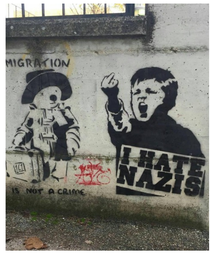
Above: graffiti in Lanciano, Italy